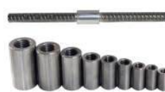
Re Bar Coupler