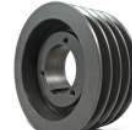
Multi Groove Pulley